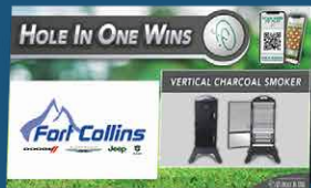
Charcoal Smoker Bonus Prize