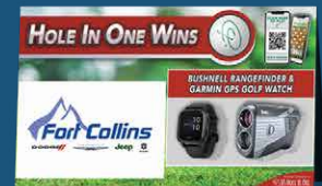
Rangefinder & GPS Bonus Prize