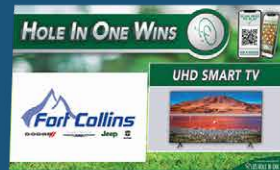
UHD Smart TV Bonus Prize