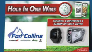
Rangefinder & GPS Bonus Prize