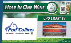
UHD Smart TV Bonus Prize