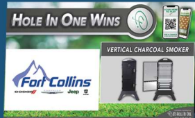
Charcoal Smoker Bonus Prize