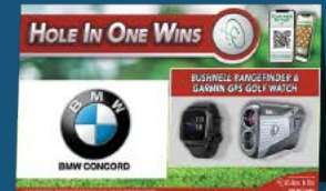
Rangefinder & GPS Bonus Prize

RECEIVE 20% OFF YOUR COVERAGE | USE CLIENT TYPE: NYSADASAVE