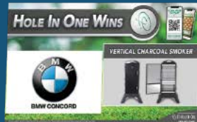
Charcoal Smoker Bonus Prize