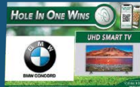
UHD Smart TV Bonus Prize