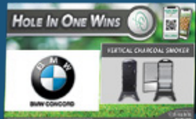
Charcoal Smoker Bonus Prize