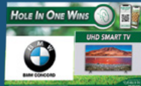
UHD Smart TV Bonus Prize