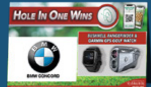
Rangefinder & GPS Bonus Prize