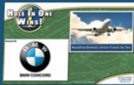
Airline Tickets Bonus Prize