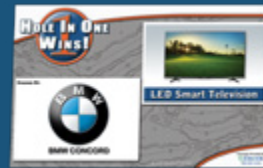
LED Television Bonus Prize